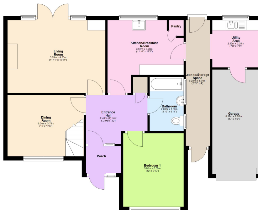
Ground Floor Approx. 94.2 sq. metres (1014.3 sq. feet)