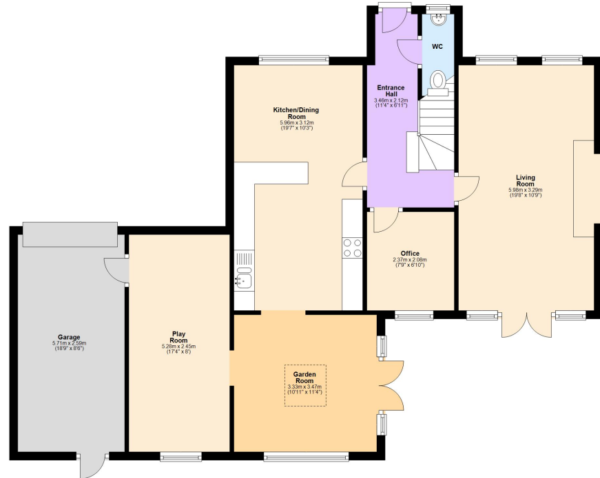
Ground Floor Approx. 95.3 sq. metres (1025.7 sq. feet)