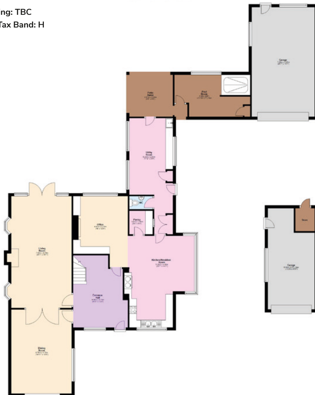
Ground Floor Approx. 209.4 sq. metres (2254.5 sq. feet)